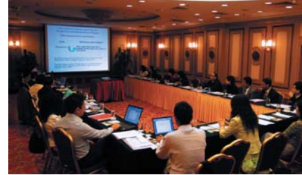
Live.Learn.Laugh. workshops aim to build capacity in oral health promotion.