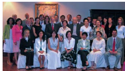
Participants from 11 European countries participated in the Live.Learn.Laugh. workshop in Madrid.

information about the partnership programme as well as presentations on project management and evidence-based oral health promotion. Country representatives had the opportunity to present their projects in detail and working groups discussed detailed questions related to project implementation and management.