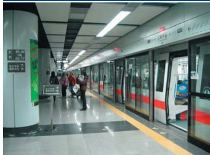
MRT Station, Shenzhen