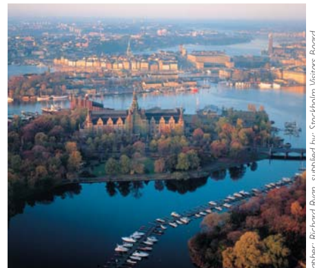
View over Djurgården

Council decided at one of its meetings in Montréal that the 2008 Congress will take place in Stockholm in September 2008. The Swedish Annual Congress will take place at the same time which means that there will be some parallel sessions in Swedish.