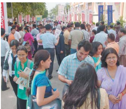
Busy outside Exhibition and Lecture Halls

The Local Organising Committee is preparing the figures on the number of participants in the scientific programme. They will be available on the web site as soon as they are ready.